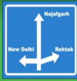
Map Type Advance Direction Sign