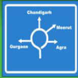
Advance Direction Sign On Rotary Inter-Section